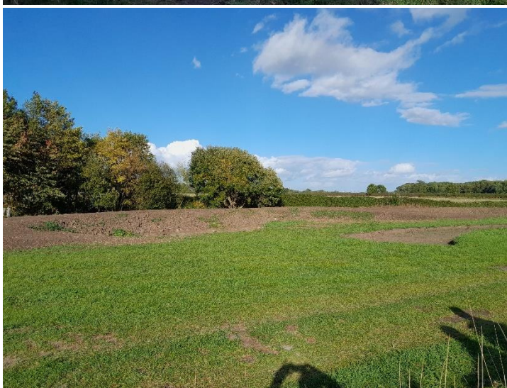
Left: New Wetland Area