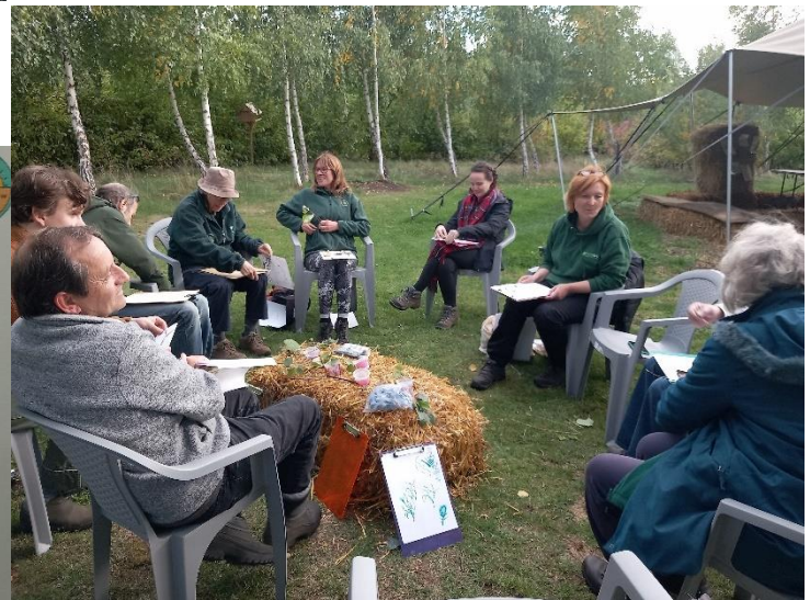
A farm tour of the adjacent Home Farm site (of which the community care farm is a part) was held, demonstrating the use of cover crops, retention of stubble, use of long horn cattle